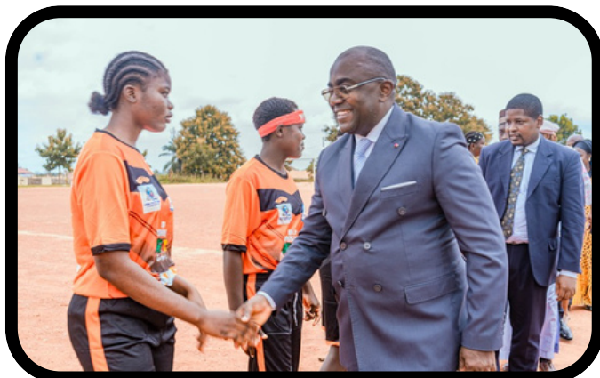
The Secretary General of MINJEC greeting athletes alongside other dignitaries