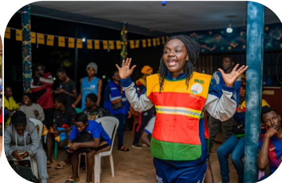
Moral, Civic and Entrepreneurial Reamament session by MINJEC staff