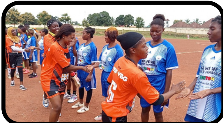
Athletes greeting each other during the opening Football Female (Stop-GBV vs Non A la Heine

OVER 300 DISPLACED YOUNG PEOPLE FROM THE NW/SW, AND FAR NORTH REGIONS—TOGETHER WITH REFUGEES FROM THE CENTRAL AFRICAN REPUBLIC AND MEMBERS OF HOST COMMUNITIES—CELEBRATED THE JOY OF PLAYING, LEARNING, AND WORKING TOGETHER AT THE NAWEWE SPORTS JAMBOREE IN BERTOUA. THE OPENING CEREMONY DREW OVER 1,500 SPECTATORS, CREATING AN ATMOSPHERE OF UNITY, EXCITEMENT, AND SHARED PURPOSE.