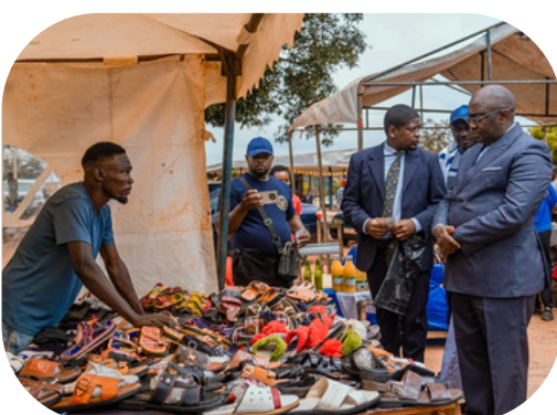
Authorities visiting exhibition stands of IDPs & Refugee

OVER 300 DISPLACED YOUNG PEOPLE FROM THE NW/SW, AND FAR NORTH REGIONS—TOGETHER WITH REFUGEES FROM THE CENTRAL AFRICAN REPUBLIC AND MEMBERS OF HOST COMMUNITIES—CELEBRATED THE JOY OF PLAYING, LEARNING, AND WORKING TOGETHER AT THE NAWEWE SPORTS JAMBOREE IN BERTOUA. THE OPENING CEREMONY DREW OVER 1,500 SPECTATORS, CREATING AN ATMOSPHERE OF UNITY, EXCITEMENT, AND SHARED PURPOSE.