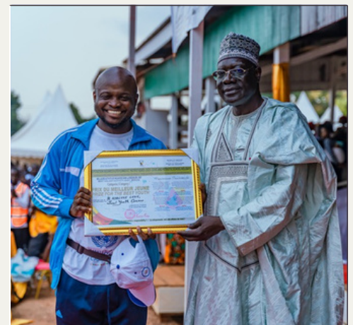
Award for Best Holiday Activity in Bertoua