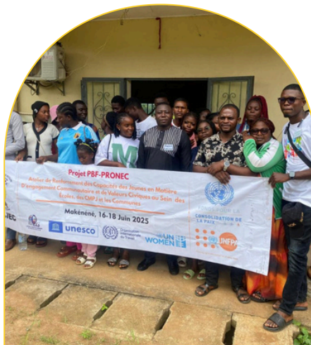
CAMPO: COMMITMENT AMIDST CONSTRAINTS

"PRONEC's values are transformative; I now see my role in building peace in my community," shared one youth participant.