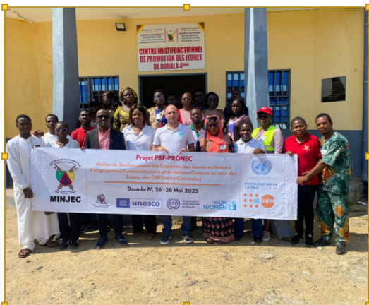
DOUALA IV: VIBRANT PARTICIPATION DESPITE THE RAIN